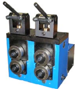
Four Roll Drive