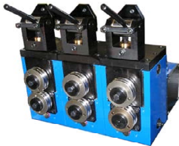
Six Roll Drive