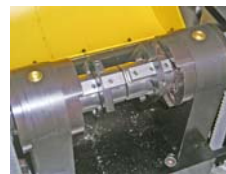
Counter Rotating Programmable Speed Arbors