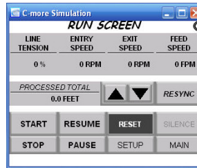
Running Status Tension – Entry Speed Exit Speed – Feed Speed