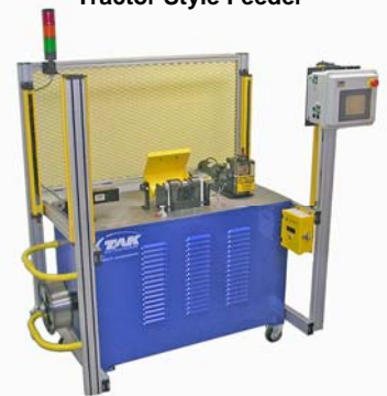
PRWS w/ Light Curtain