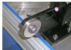
Wire Anti-twist Device Wire Cleaner Lubricator