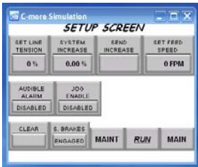
Line Tension – Spindle Speeds – Feed Speed – Alarms