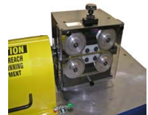
Programmable Speed Tractor Style Feeder