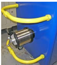
Integrated Side Payoff Programmable Back Tension