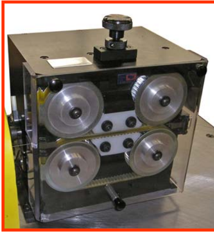
Dual Belt Tractor Feed

The TAK Dual Belt Tractor Feed can be integrated with most fine wire and strip processing operations, and offers features and benefits that make it an excellent choice for pull-feeding applications. The material is guided between two pressure pads, one above and one below the cog belts. Pressure on the belts is applied through an adjustable jack screw or pneumatic cylinder. The cog belts are molded from a plastic material soft enough to flow around the wire diameter, but not so hard as to damage or distort it. The force is spread out over a large surface area so it has only minimal effect on the material being pulled, yet provides ample grip. The need to grind feed roll tooling and guides for each specific wire diameter is eliminated due to the nature of the belt material. Depending upon the specific application, constant speed, variable speed, stepper or servo motor and controllers can be utilized to drive the feeder.